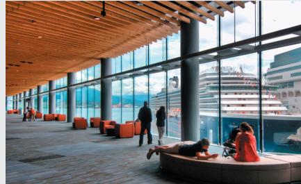
Vancouver's cruise ship terminal is integrated into the new convention center. Step out of the convention hall and onto your Alaska cruise.

As you plan your Vancouver WCD experience, don't forget to book pre- or post-congress tours and activities. You may be surprised to learn that the Vancouver Convention Centre also serves as the official ship terminal for spectacular 7-day Alaskan cruises. So you can literally begin or end your WCD trip by stepping right out of the convention hall and straight onto your awaiting luxury liner. You can even combine a cruise with a rail tour to North America's Rocky Mountains. Or begin or end your North American vacation from here. There is no end to the possibilities.