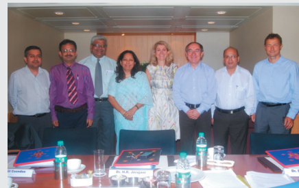
IADVL L'Oreal Pigmentation Research Grant Jury meeting at Mumbai on 28th Aug. 2010:

DERMACON 2011, 39th National Conference of IADVL will be held on Feb 3-6th, 2011 at Gurgaon, Haryana near New Delhi. ( www.dermacon2011.org ).