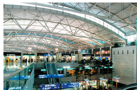
The night view of the Incheon Int. Airport

Seoul also happens to be one of the easiest locations to be reached by air, thanks to the award-winning Incheon International Airport which serves over 70 airlines and 150 worldwide destinations. Incheon International Airport was named World's Best Airport for 2009 by Skytrax, and by Global Traveler (GT) in 2007 and 2008. The official Congress airline is Korean Air, one of the world's top international airlines which flies to 117 destinations in 39 countries. Participants can book a flight with Korean Air by visiting their website at www.koreanair.com . Participants from China and Japan may also choose Gimpo International Airport as their destination.