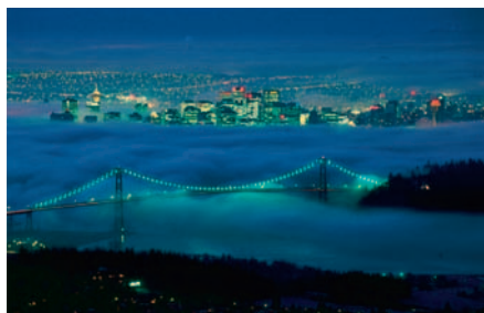
Lions Gate in fog at night

We look forward to welcoming you to Vancouver for the 23rd World Congress of Dermatology on June 8 to 13, 2015!