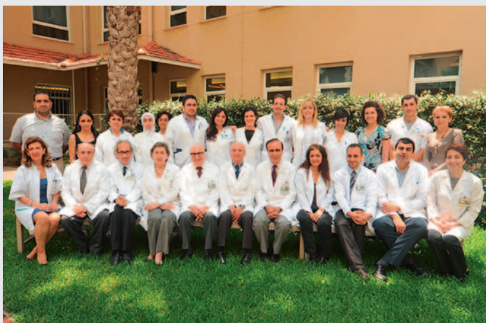
Group photograph, Department of Dermatology, American University of Beirut Medical Center

In conclusion and in my capacity as a Chair of the Department and as a board member of the ILDS, If I have reached out and touched at least one person per annum over the course of nearly a quarter of a century of teaching at this outstanding department and in the board, I realize with a joy coupled with humility that I have reached out and touched the lives of many, many people, and, in return, they too have reached out and enriched my world of dermatology.